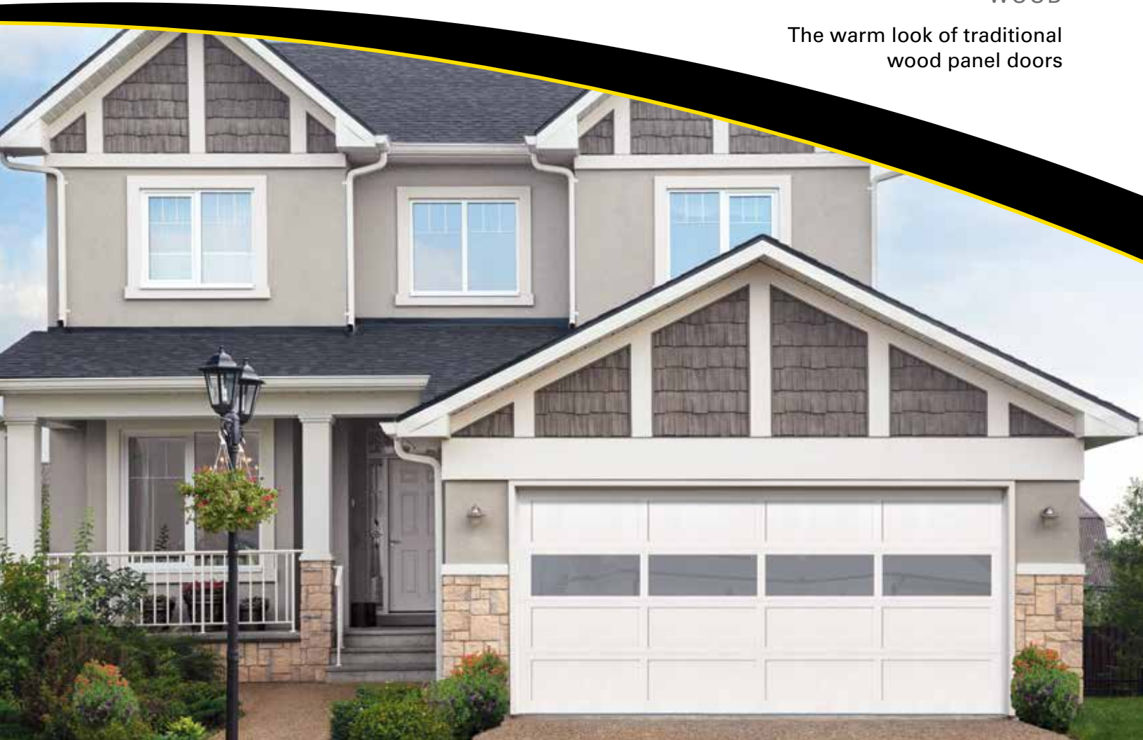
Colonial Model 105, Plain Long Panel windows

The warm look of traditional wood panel doors