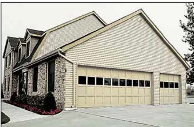
Colonial Model, plain short panel windows

*Other Stockton windows are available. Consult your dealer for details.